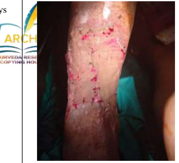
Fig. E: pre-op wound with healthy granulation, reduced edema & discoloration.

Fig. F: Intra operative status of spilt thickness skin grafting.