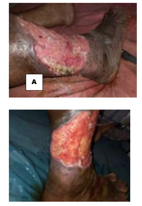
Fig. A: On day 1, when the patient was attented in the opd;

Fig. B: Reduced slough after 4 days (vranashodhana taila used for dressing)